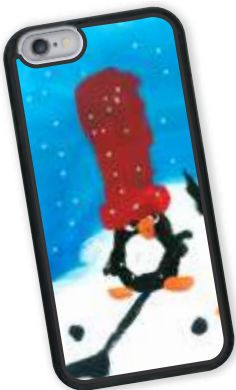
Cell Phone Cases