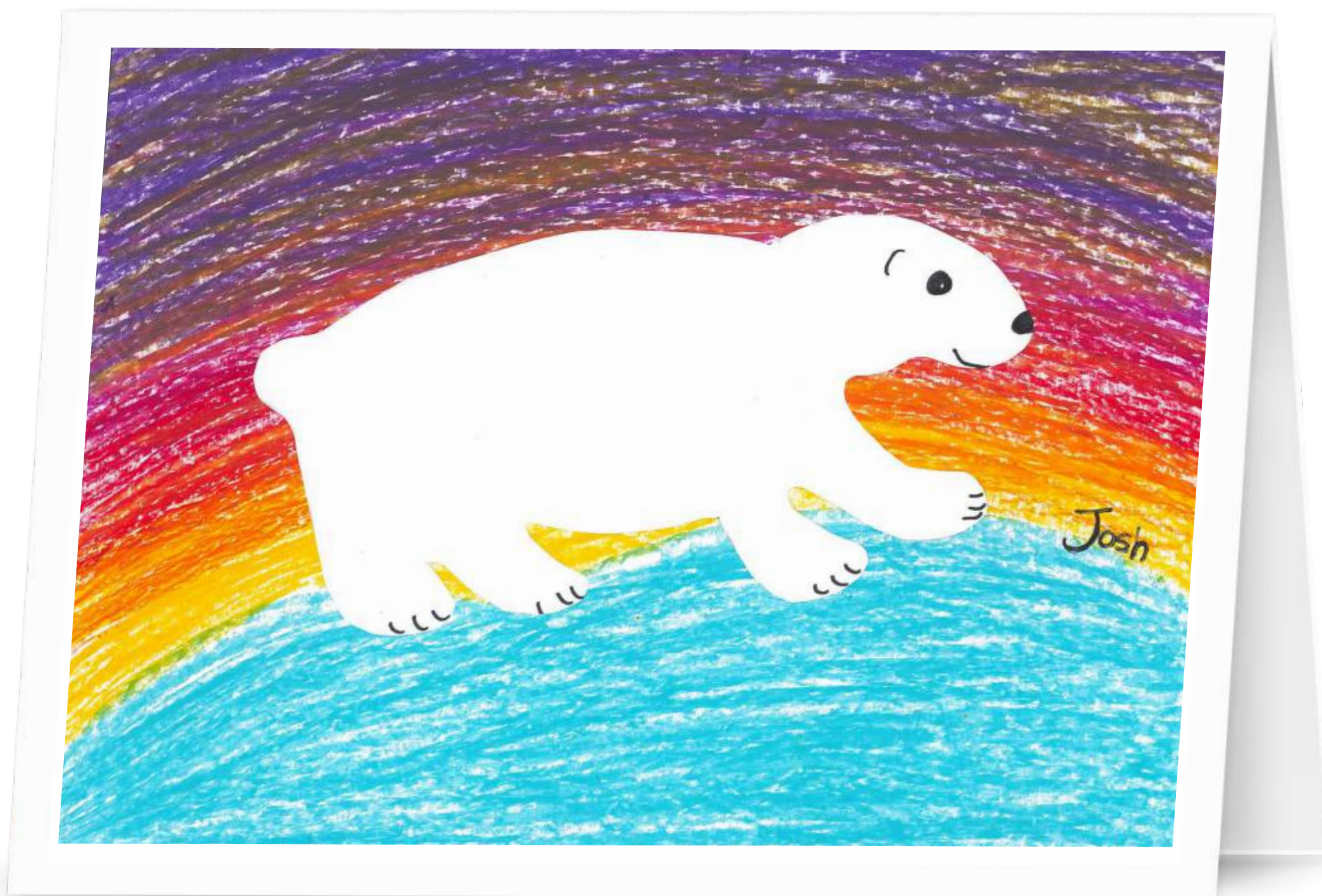
Arctic Polar Bear