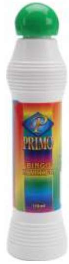
Green Bingo Marker (Dollar store)